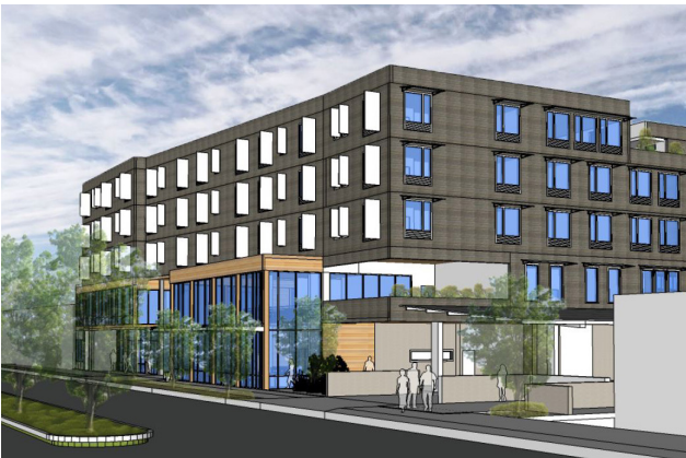
Rendering of HopeWorks Station Phase II

HopeWorks is thrilled to announce that the Bill and Melinda Gates Foundation has approved a $1.5million capital grant for constructing the commercial space in our new HopeWorks Station II building!