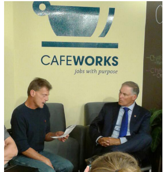
Gov. Inslee visits HopeWorks Station

GroundWorks is ready for the fall season and is available for hire for your autumn garden needs. Have tree planting and yard raking that you'd like help with? Give us a call at (425) 610-4935.