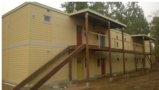
Progress at Twin Lakes Landing 16418 Twin Lakes Ave, Marysville

Tour the grounds and units at noon, short program at 1.