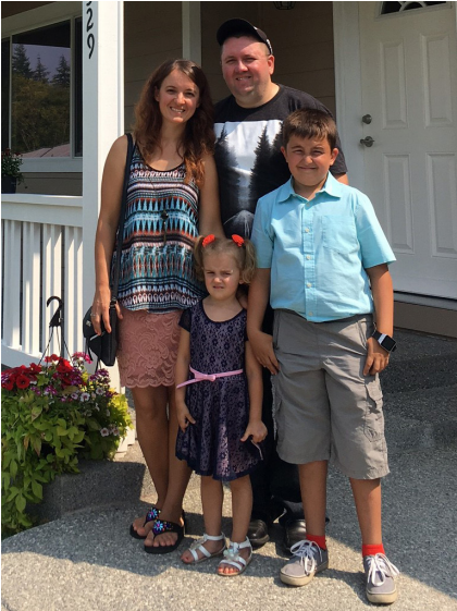
New Owner/Builders at Parkwood Estates in Arlington!

This summer, six families finished construction and got keys to their very own homes! These families spent over a year working 30 or more hours a week building their own and their neighbors homes at Parkwood Estates, our most recent Team HomeBuilding site.