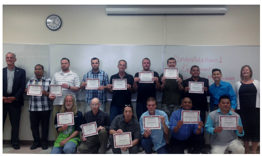
EduPloyment graduates and Housing Hope staff proudly displaying their manufacturing certificates.

Our EduPloyment program is now recruiting for a retail and hospitality management program, beginning in September. Through Everett Community College, students will learn customer service, business and communication skills for a career in hospitality.