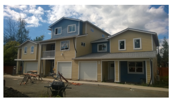
Construction continues on Monroe Main Street

families. Over the next 10 years this north county