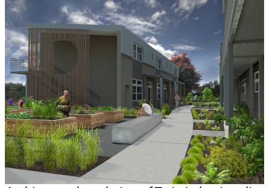
Architectural rendering of Twin Lakes Landing

Twin Lakes Landing is expected to break ground this fall! This 50-unit development will provide adult life skills classes, child development services and job training programs for homeless and low-income