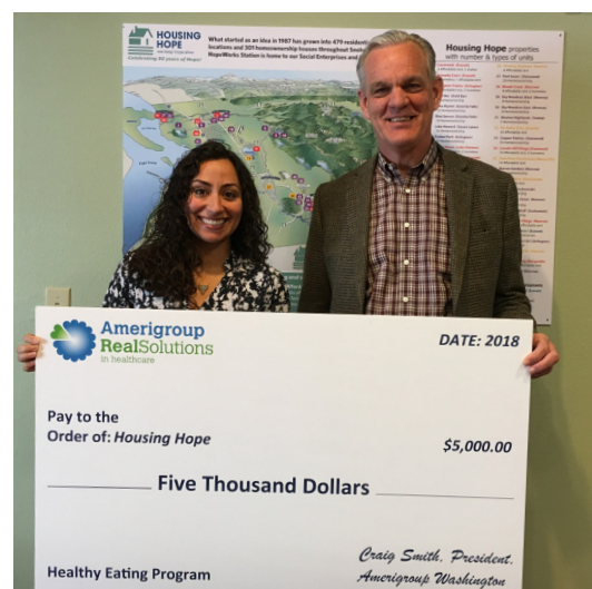
Thank you Amerigroup Foundation for your support!

Recently, we were awarded a grant from Amerigroup Foundation to support health and nutrition at Tomorrow's Hope Child Development Center and College of Hope. This grant will help us provide more fruits and vegetables to Housing Hope children and families. Thank you so much for your support!